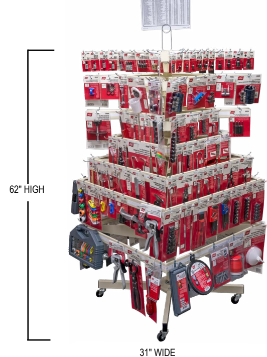
GONDOLA NOT INCLUDED

47120 Rotary Waterfall Display. Box. Shipping wt. 230 lbs.