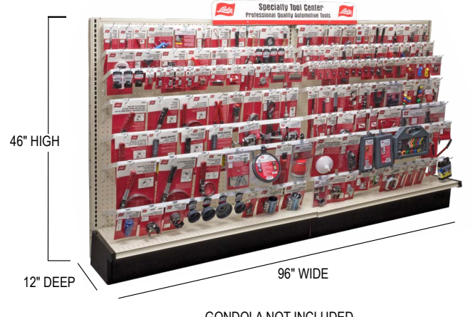
GONDOLA NOT INCLUDED

47600 Waterfall Gondola w/ Tools, 4'. Box. Shipping wt. 156 lbs.